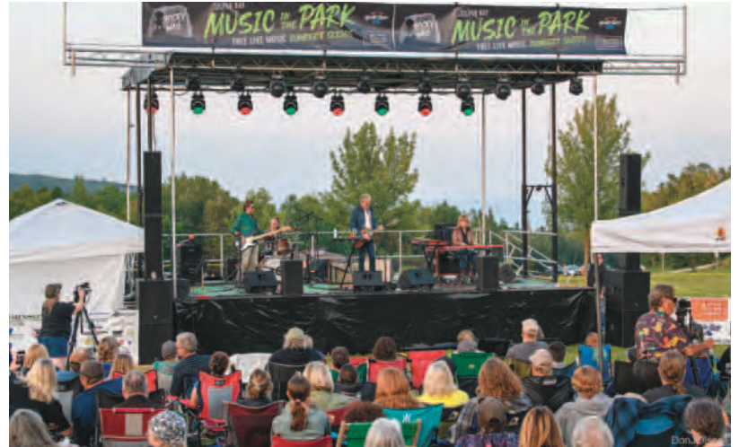
Rocky Wall Entertainment’s free concerts in Silver Bay draw a crowd. Here with The Jayhawks in August 2024.