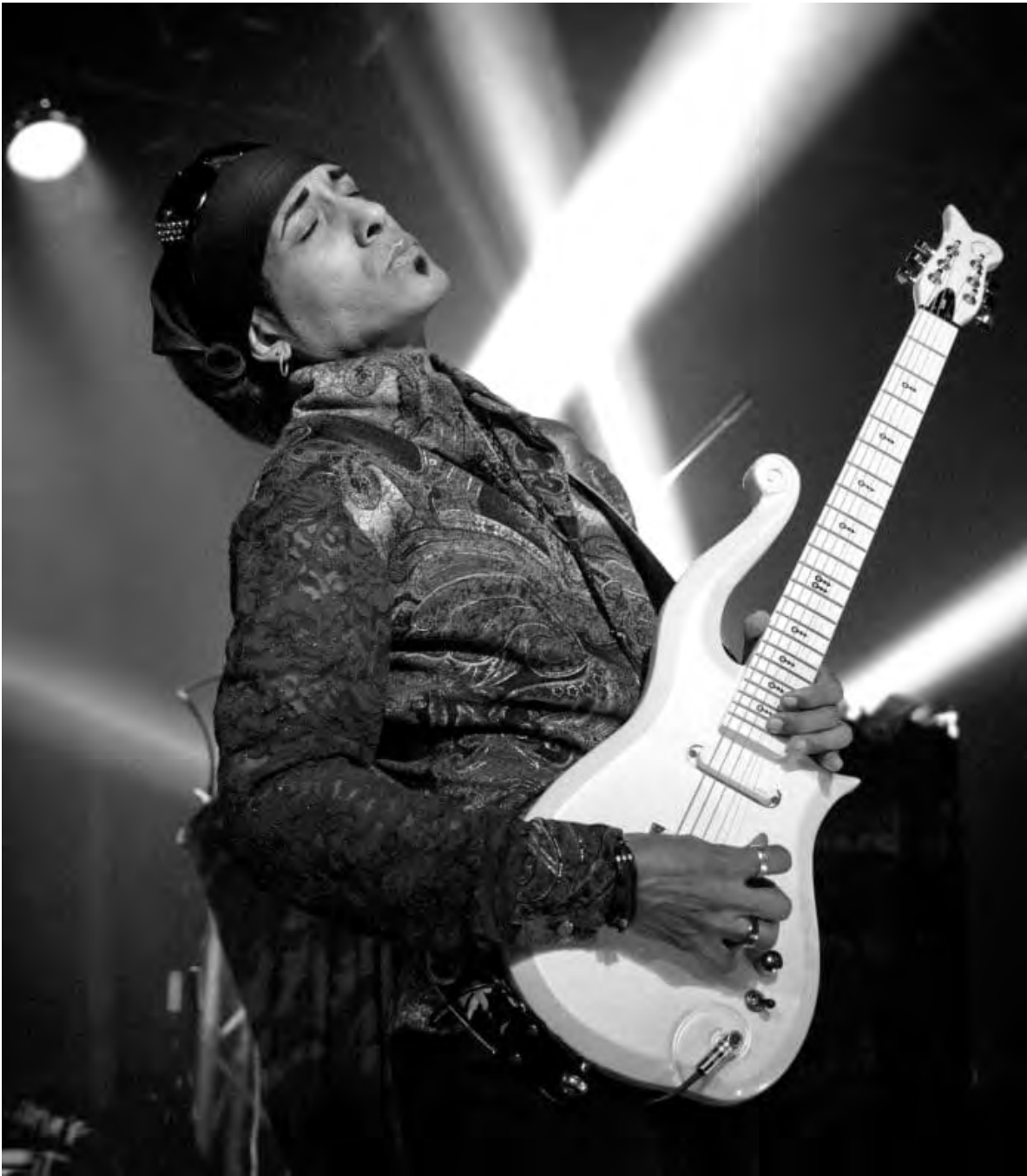
Chase & Ovation, a Prince tribute band, will perform at Silver Bay's Music in the Park Concert Series on Friday, August 15th.

Some artists leave a mark so deep that their passing becomes a permanent memory. I can count on one hand the musicians whose deaths I remember vividly. David Bowie is one of them. I was driving to pick up a puppy from a dairy farm the day he died, January 10, 2016, and I tried, unsuccessfully, to rename our soon-to-be Loki, "Bowie."